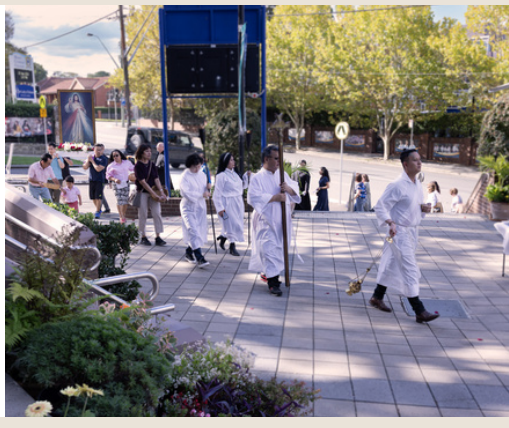
Divine Mercy Sunday celebrations were wonderful!