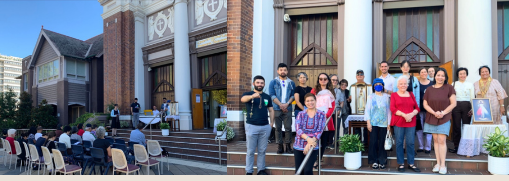
A gorgeous sunny day to pray our First Saturday rosary on the forecourt!