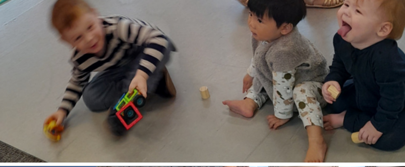
All smiles at playgroup this week!