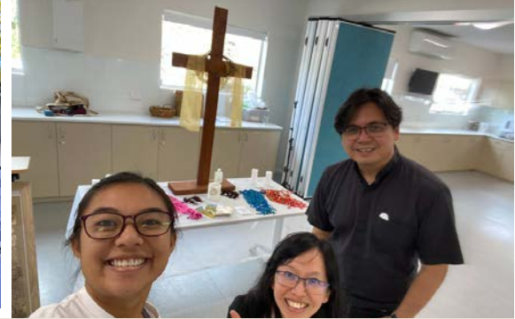
Our office staff joined the students and staff at OLOD Primary for a day retreat!